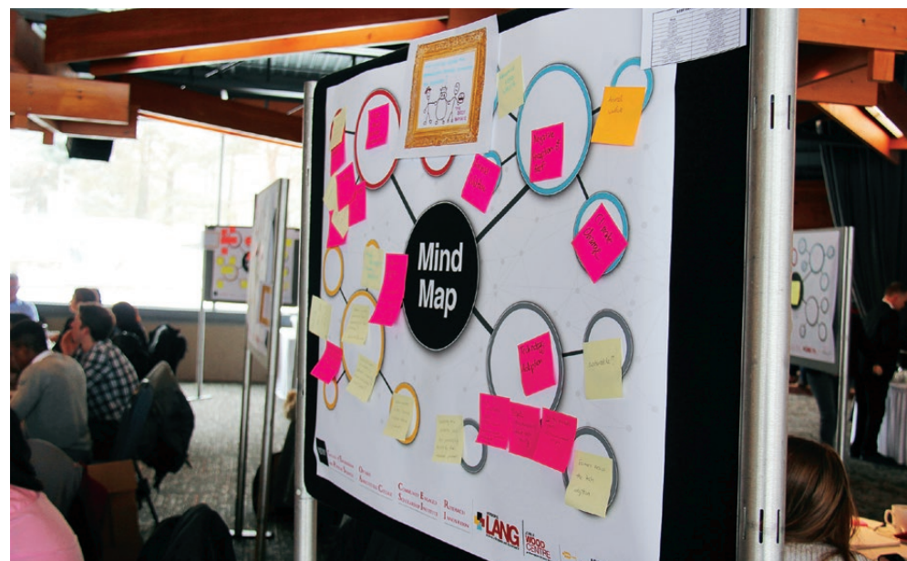
Improve Life Challenge: Hack the Farm focused on interdisciplinary collaboration and participation from various colleges across the University of Guelph to solve pressing challenges facing the food and agriculture sector today