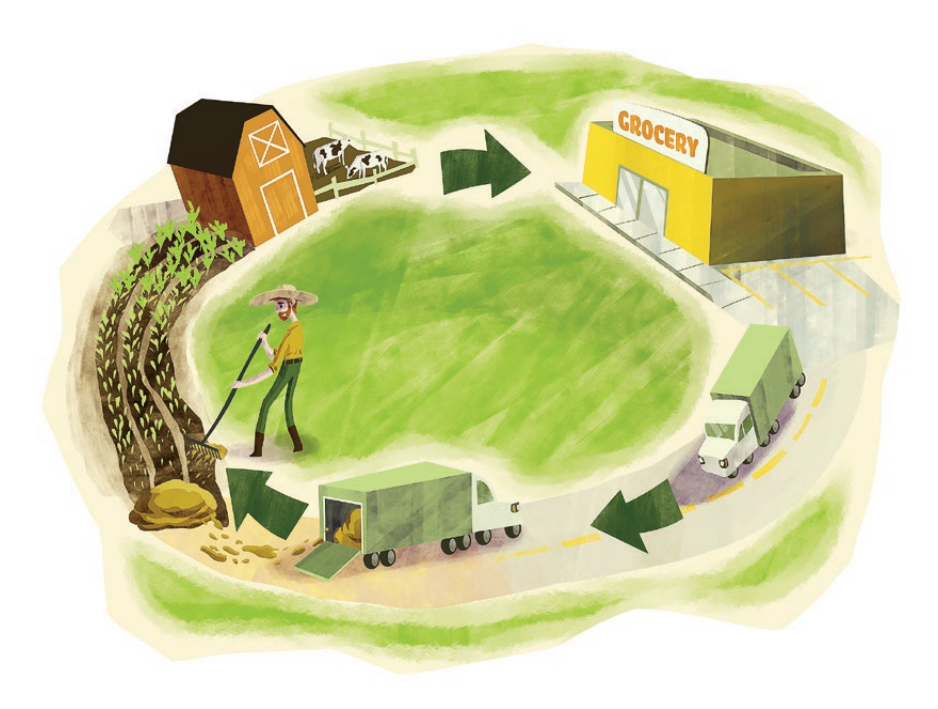
An illustration of the circular food economy from the Spotlight Project.