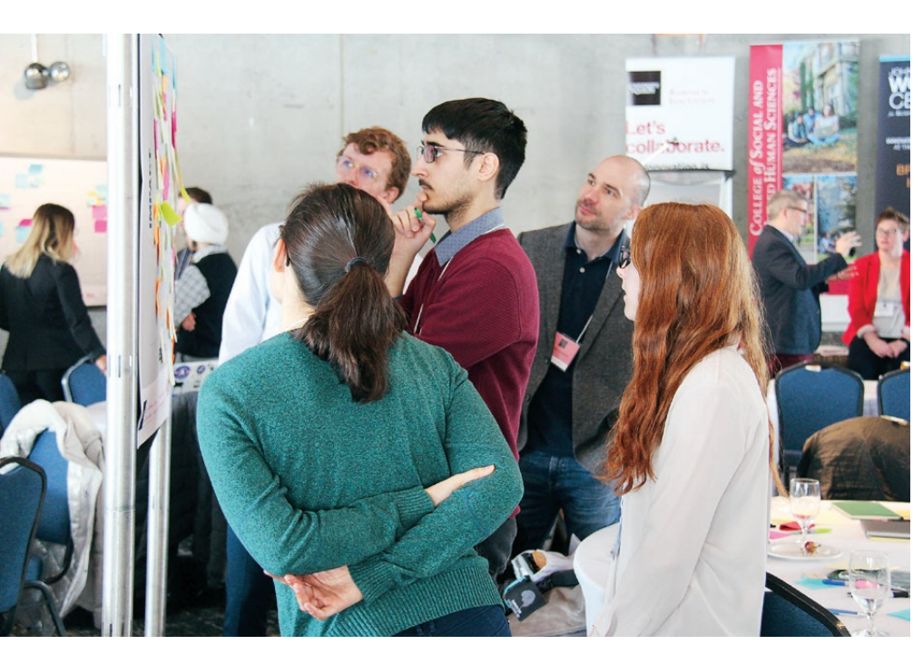
Critical thinking skills at work at the Improve Life Challenge: Hack the Farm.