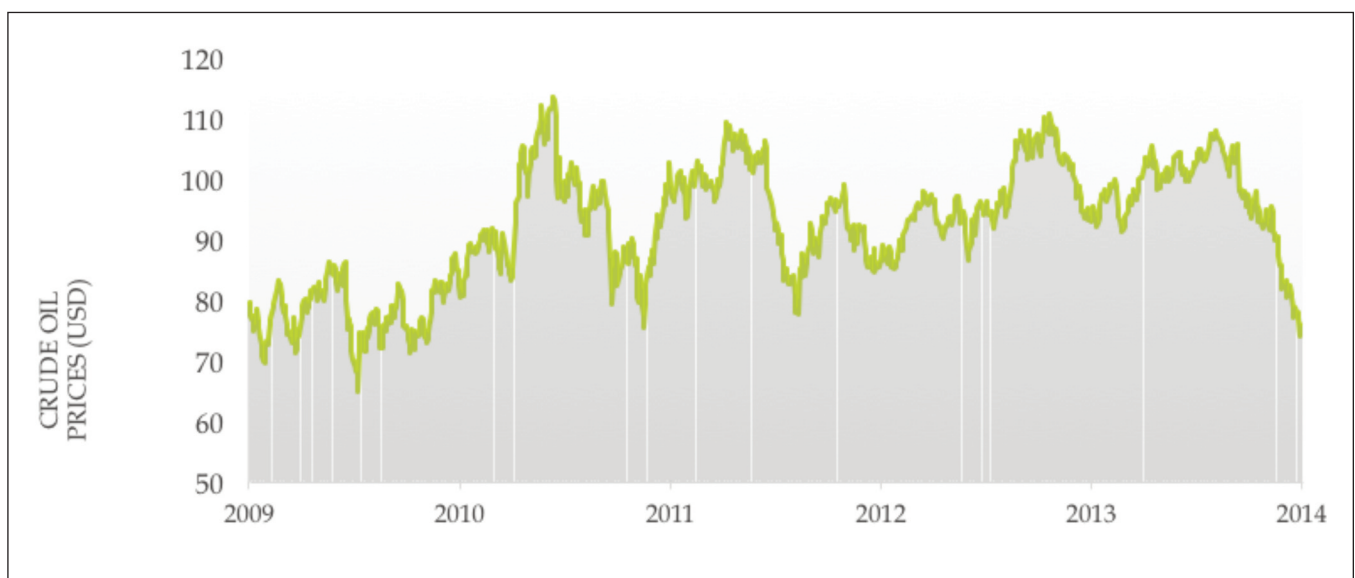
Figure 2: Crude Oil Prices (USD) From 2009 to 2014

The end of the American-Canadian dollar parity occurred during 2014, with the Canadian dollar currently trading below 90 cents on the greenback toward year-end. These effects will continue to have upward pressure on produce prices on the horizon since produce import levels tend to increase in the winter and spring.