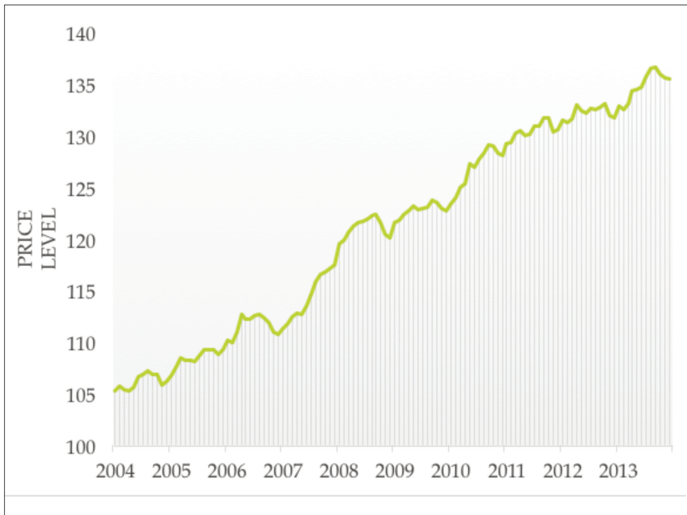
Figure 1: Change in Food Prices From 2004-2014