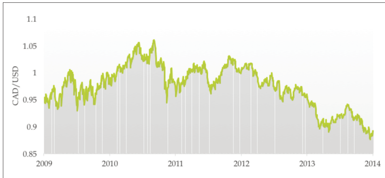
Figure 5: CAD/USD Exchange Rate from 2009-2014